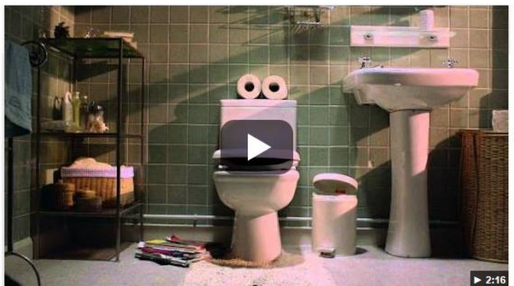
World Toilet Day song for WaterAid - YouTube https://www.youtube.com/watch?v=otsbGfSW_cc

On the Thursday YoYo will be coming to spend the whole day with us to do an RE day on the theme of Water. We will use our Facebook page to get pictures out quickly to keep you informed about what is happening during the week and also put some updates on the website.